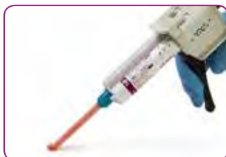
Easy cartridge delivery.