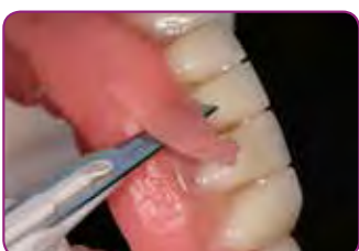
Remove the excesses using a scalpel or scissors. Trim with GC RELINE II POINT FOR TRIMMING.