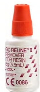
GC RELINE II Remover for resin