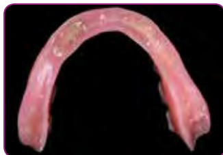
Initial denture, to be relined following the placement of 4 implants.

Straightforward application & handling, throughout the entire procedure