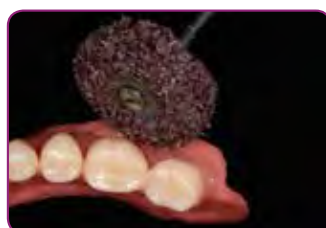
Finish with GC RELINE II WHEEL FOR FINISHING.