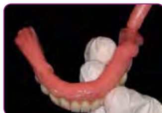
Apply GC RELINE II (Extra) Soft. Working time is 2'00".