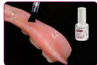
Apply GC RELINE II Primer on the area to be relined. Gently dry with air.