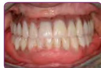
Seat the denture in the mouth and muscle trim. Retain in situ for 5'00".