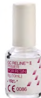
GC RELINE II Primer for resin

You can add material within 3 months after the first application, to adapt to changes of the mucosa and bone. The new GC RELINE II Remover for resin makes it possible to remove the relining layer and replace it very quickly.