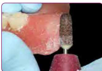
Improved trimming ability for a better finition of margins

Its improved trimming ability makes the ultimate finishing of margins even easier.