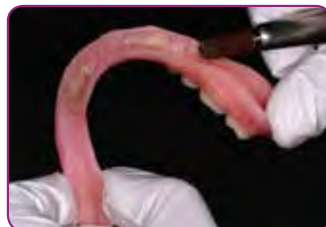
Relieve the area to be relined and roughen the surface.